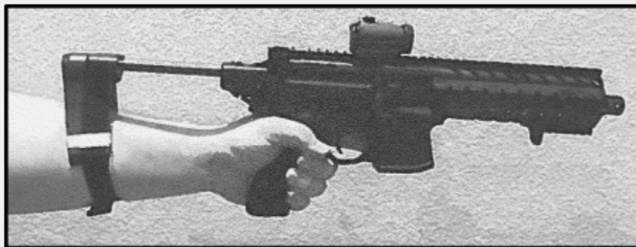
2015 submission of "adjustable stabilizing brace"

148. For example, in 2015, ATF found that attaching SB Tactical's adjustable stabilizing brace product to a pistol "would not be a 'short-barreled rifle.'" 5 Rule, 88 Fed. Reg. at 6,488; see also ATF Letter 304296 (Dec. 22, 2015), attached as Ex. N.